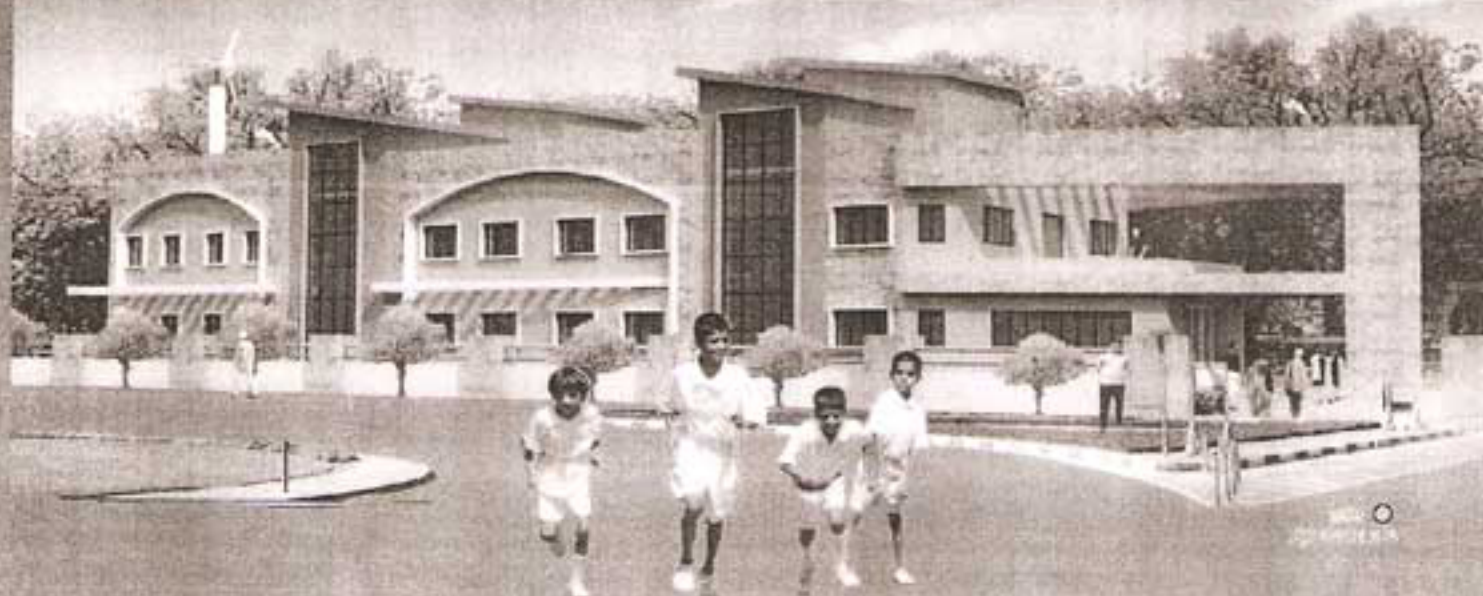
Proposed Construction of Institute for the Mentally Handicapped